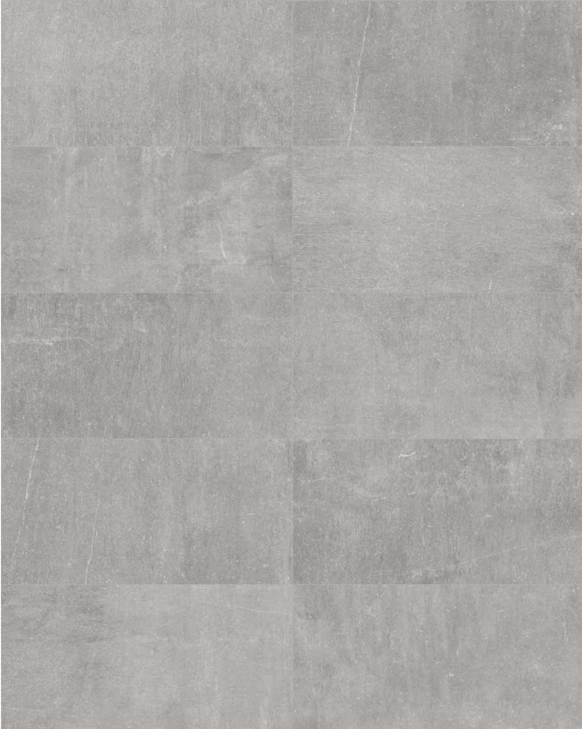
12" x 24" NEXUS MICA HD PORCELAIN TILE