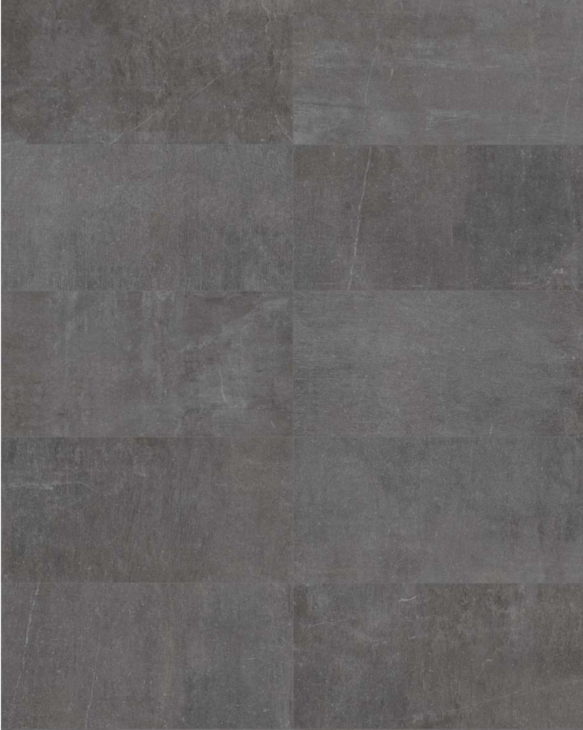
12" x 24" NEXUS GRAPHITE HD PORCELAIN TILE